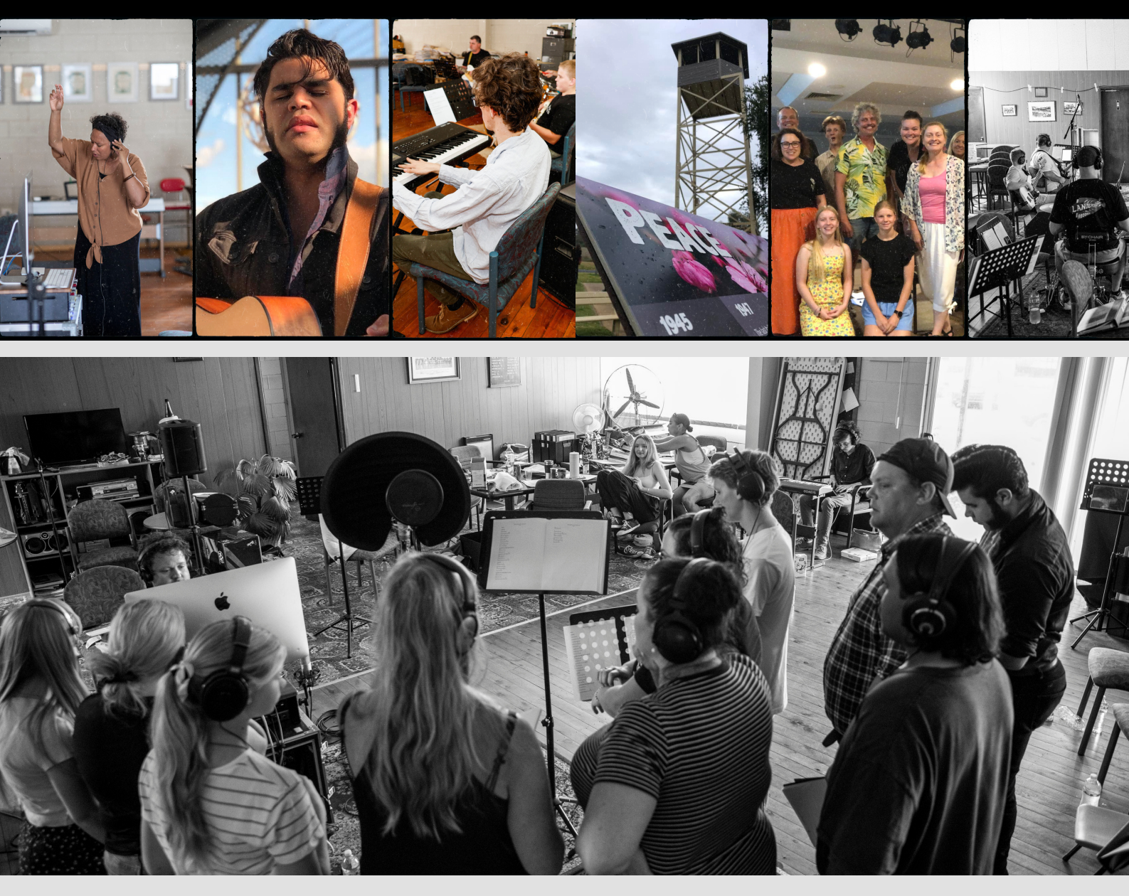
Above: Intertwined cast members recording with Producer Kris Schubert for the album recording.